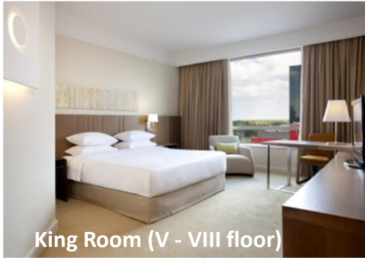
King Room (V - VIII floor)

Equipped with comfortable goose-down duvets, broad writing desks, bathroom with separate bath and walk-in shower unit.