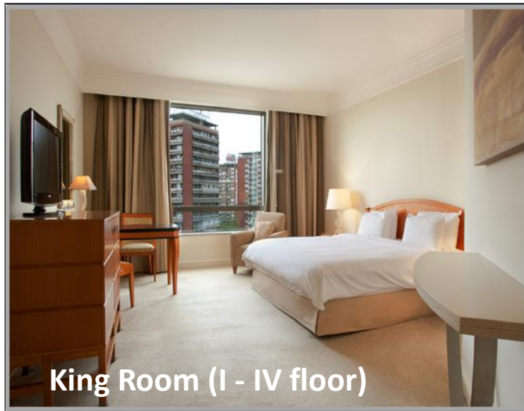
King Room (I - IV floor)